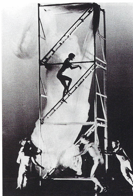
A performance of Parades and Changes in 1970 in Stockholm